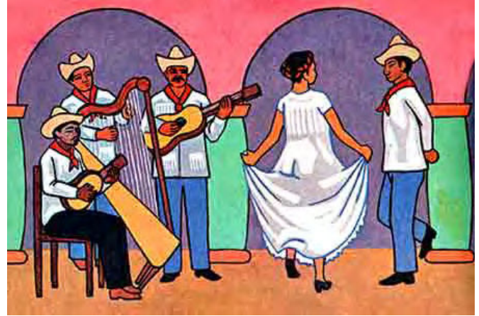
A typical “son jarocho” group with dancers.

Listen to the instruments played in “ La Golondrina ”. The first instrument you hear is a requinto from the same family as the jarana , and is the one in charge of introducing the melody of the song. Other than the jarana , the leona and the violin , can you guess which other instruments are being played? Who's playing the percussion in the ensemble? Which of these instruments are common in other music? What instruments are different?.