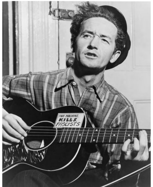
Mr. Woody Guthrie playing his emblematic guitar.

Mr. Woody Guthrie was born in 1912 in a small town in Oklahoma called Okemah. He is a singer-songwriter and musician whose musical legacy includes hundreds of political, traditional, and children's songs. Many of his songs are about his experiences during the Great Depression when he traveled with displaced farmers from Oklahoma to California and learned their traditional folk and blues songs, earning him the nickname the "Dust Bowl Troubadour".